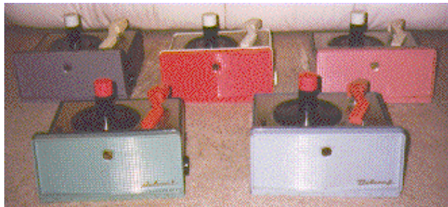
DING DONG SCHOOL PLAYERS WITH CARRYING CASES