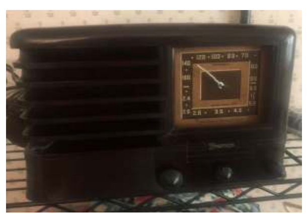
Recapped and playing well again

Then I checked out the chassis and underneath it looked original. After a full recap and replacement of one bad tube, the set was playing again although the speaker sounded terrible. I was able to fix it by removing the old tape on the cone and gluing the rips in the cone.