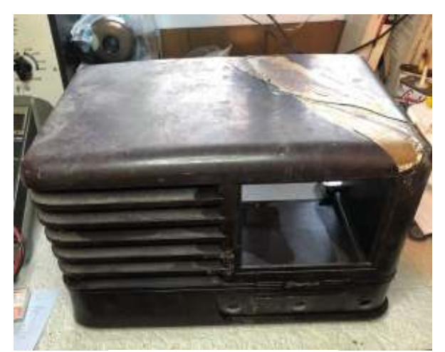
All Bakelite parts were there