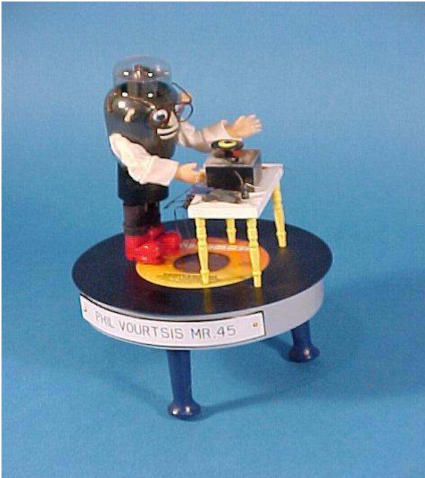
Custom made display presented to the editor during a New Jersey Antique Radio Club meeting.

"Mr. 45" Trophy presented to your editor