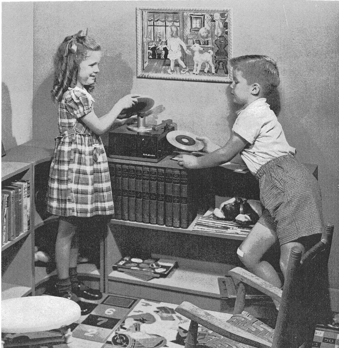
Children enjoying a 9EY3 phonograph (1949).

adjustments can be done with the provided screws and cams. The only exception is the lever that operates the muting switch. You would think that the switch should be operated when the tonearm is descending to the record and then disconnect. But the only way to achieve that is to bend the lever that contacts the muting switch. There is no other adjustment.