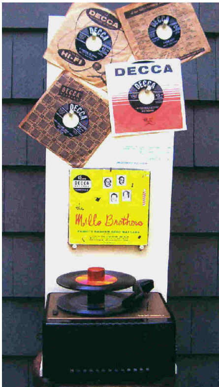
45EY2 featured in Mills Brothers Convention display