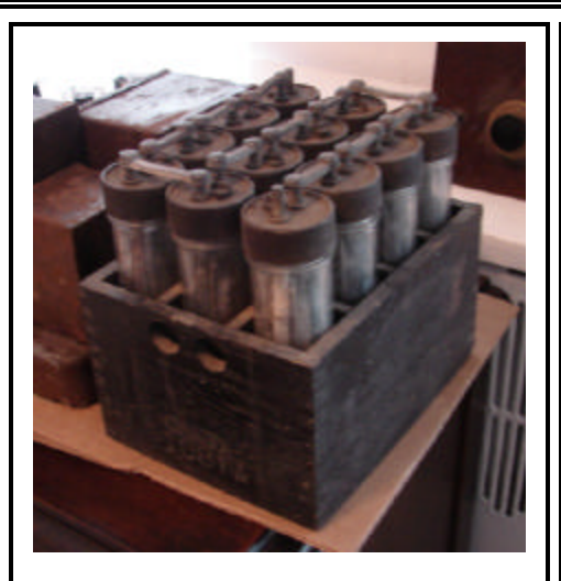
Willard wet cell "B" (24 volt) battery