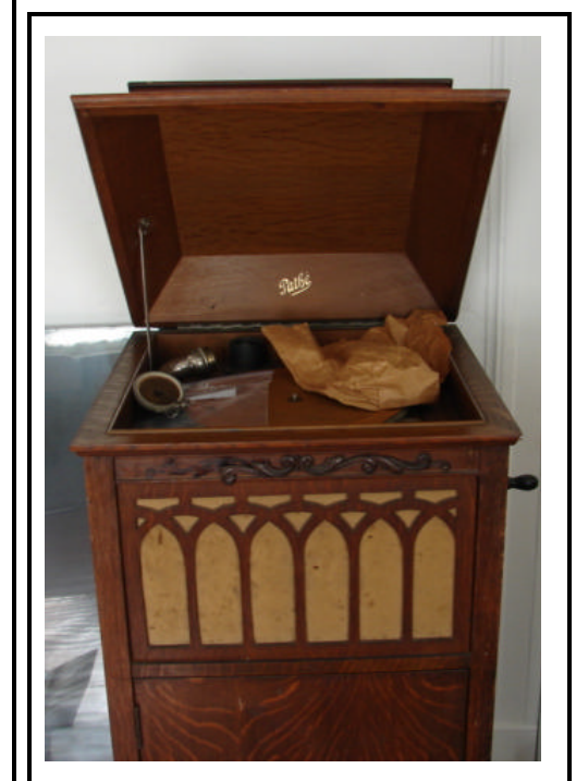
Pathe crank victrola