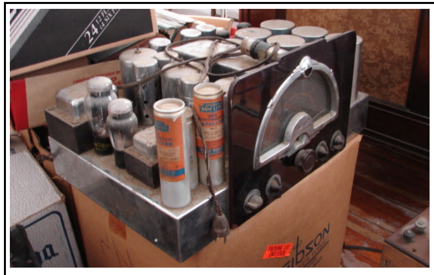
McMurdo Silver 15-17 chassis with speaker

Homebrew power supply; copper shielding with globe 80 tube. ("You'll never see another one like this.")