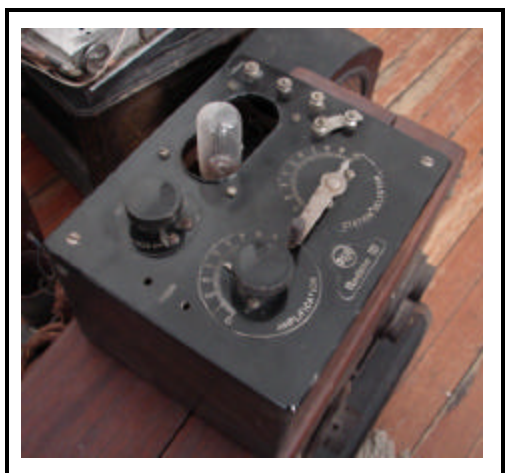
Radiola III (WD-11 has open filament)