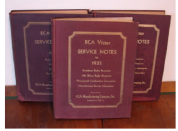
RCA "red book" service notes