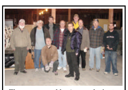
The crew assembles (my apologies to the camera shy.)

The response from NJARC members was inspiring. Fortunately, all floors were smooth with no thresholds, and rolling equipment was available to aid the effort, but the work was difficult (especially for some of us older guys) and a lot of individual lifting and schlepping was involved. However, the club prevailed and all the equipment was moved by mid-afternoon on Saturday. Hats off to all volunteers and another NJARC job well-done.