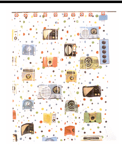
The Radio Days Shower Curtain. FM radio and "toolbar" control panel are in upper right.

The darn thing even comes with an FM radio, pre-installed antenna, and a waterproof keypad to control power and volume and change stations. And, if you were just wondering, three 'AAA' batteries (which are said to last 90 days) were also included. At a price tag of $6.00, was this too good to be true or what? The "made in China" label and what was described as a touch sensitive "toolbar" control panel gave me some second