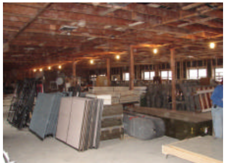
A job well-done.