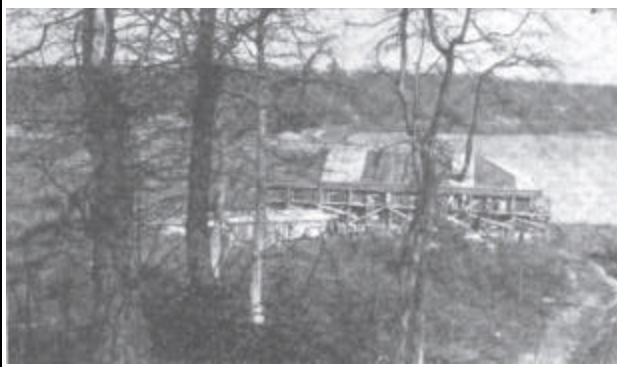
The Operations building under construction in 1913-14. The Armstrong demonstration is believed to have occurred in the construction shack visible in this photo. The building still stands but is in need of restoration.