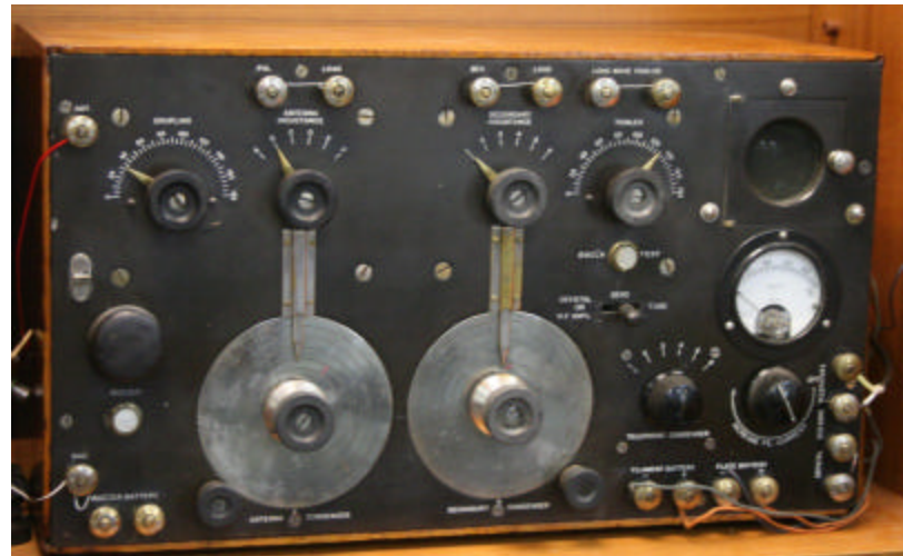
The IP-501 was the U.S. Navy's first receiver with a vacuum tube inside the cabinet. This set will be used as a stand-in for the Marconi 101 above.