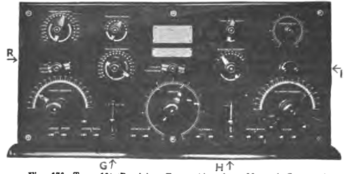
Fig. 173—Type 101 Receiving Tuner (American Marconi Company).

Armstrong's experimental regenerative receiver was compared to the American Marconi Type 101. This was a sophisticated crystal set, and probably one of the best receivers then in use.