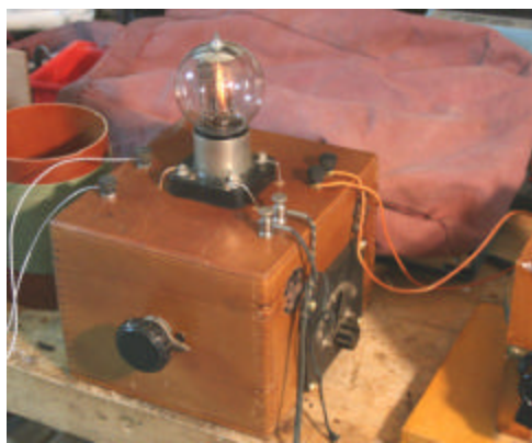
It is not known what the original regenerative receiver looked like when Armstrong made his initial discovery, but Al Klase has tried to duplicate it, at least technically, as close as possible.

Armstrong's experimental regenerative receiver was compared to the American Marconi Type 101. This was a sophisticated crystal set, and probably one of the best receivers then in use.