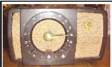
A Model H723Z2 (chassis 7H04Z2) Zenith radio from 1952.

obsolete in less than two years, and software is updated almost monthly, I find it very interesting that Zenith could manufacture a set with the same components from 1946 to the late 60's - a run of 20 years. I don't know, but I suspect the tooling was paid for by 1950, so 'ya reckon they made money?