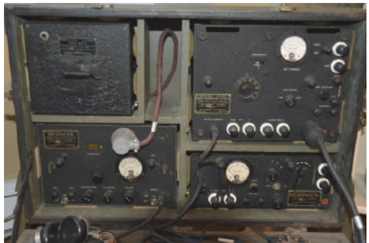
The author's SCR-178.