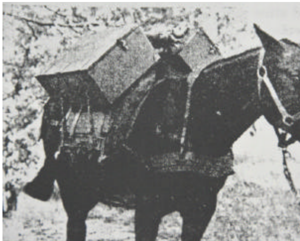
The SCR-179 mounted for transport.