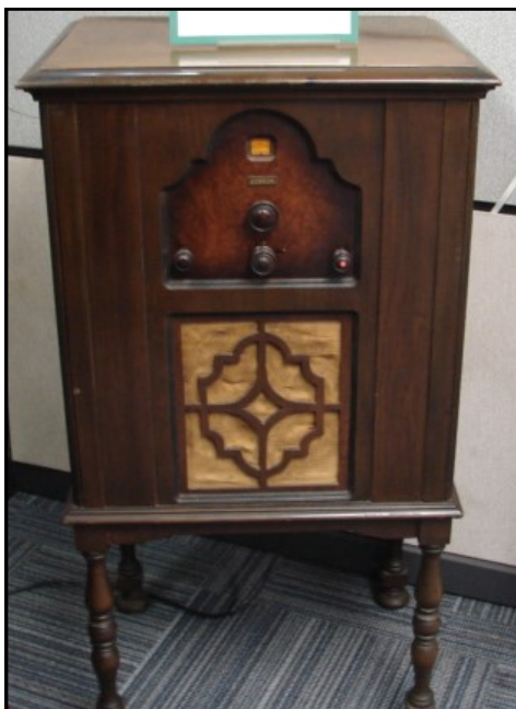
The museum's Edison R2