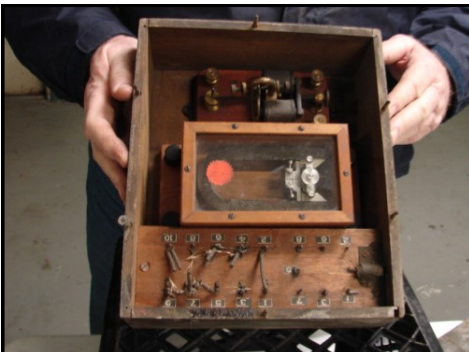
Jerry Dowgin showed the club a wooden box that was retrieved outside a bank that had undergone demolition. Inside could be seen a polar relay, galvanometer and terminal board. Jerry wasn't sure what the unit was used for and brought it in to solicit some ideas from the club. There wasn't much forthcoming, but my research found that in the early 1900's, galvanometer circuits were used to indicate the status of bank alarm and fire alarm circuits. The polar relay could have possibly been used to actuate some sort of status indicator or perhaps an audible alarm.