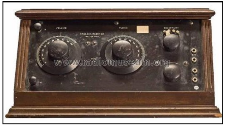
The ZR-4 "Transcontinental" with Gimbel's logo in the Mark Mittleman collection. Note that, with the exception of the slant front panel cabinet and antenna/ground connections, it duplicates the Chelsea Model 122 (RadioMuseum photo). The interior component arrangement is also exactly the same.