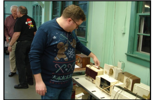
Wonder if I can sneak this one past the wife?