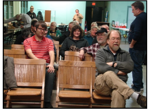
One-half of a very nice turnout.