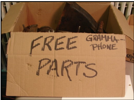
Someone's always unloading free "stuff" at our monthly meetings.