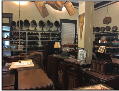
The famous Voice of the Twenties Museum. Notice the numerous AK breadboards in the background.