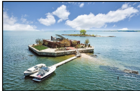
Columbia Island today, on the market for $13 million.