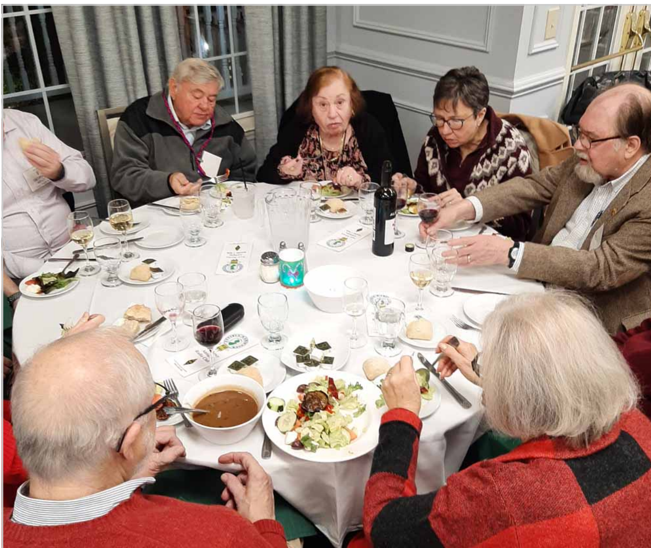
Dinner is served