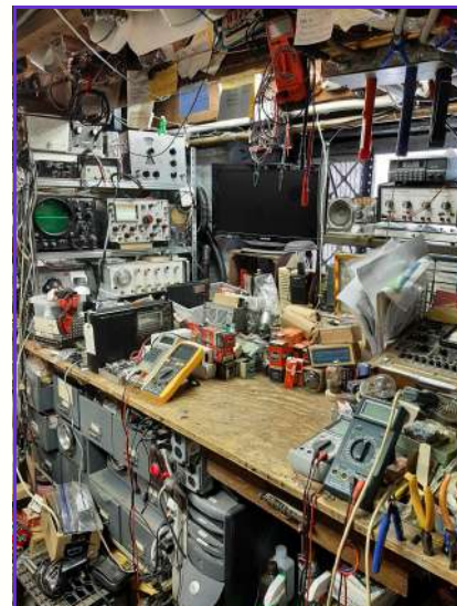
The President's Workbench.