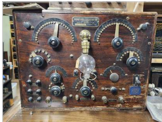
A recently-acquired item in Mike's collection