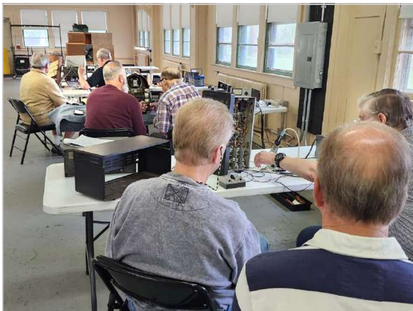
Our "abbreviated" Spring Repair Clinic