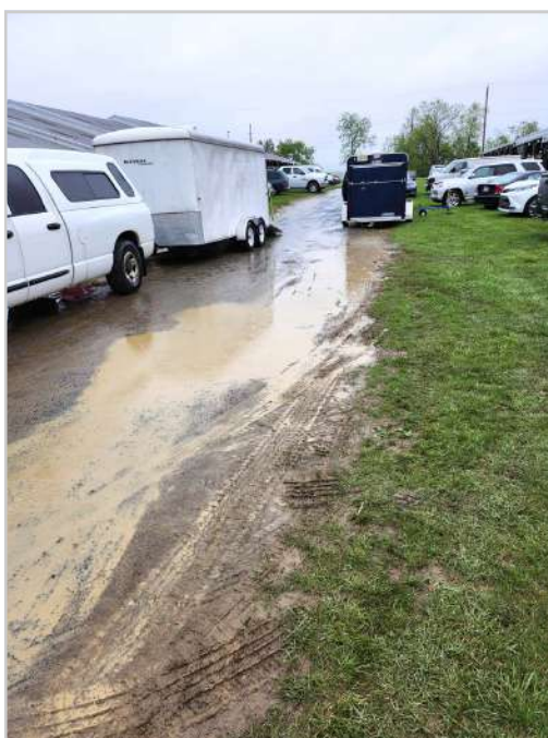
The now famous Kutztown Creek