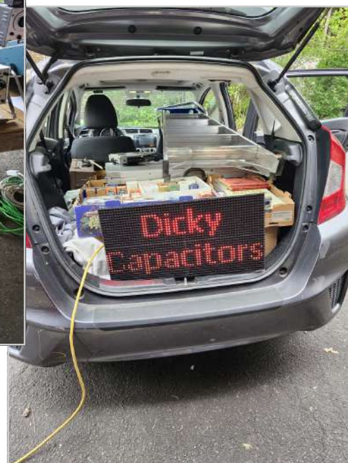
Dicky Capacitors packed and on the road to Kutztown