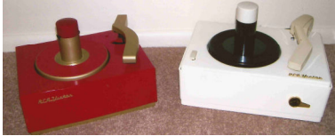
Parts units brought back from the dead