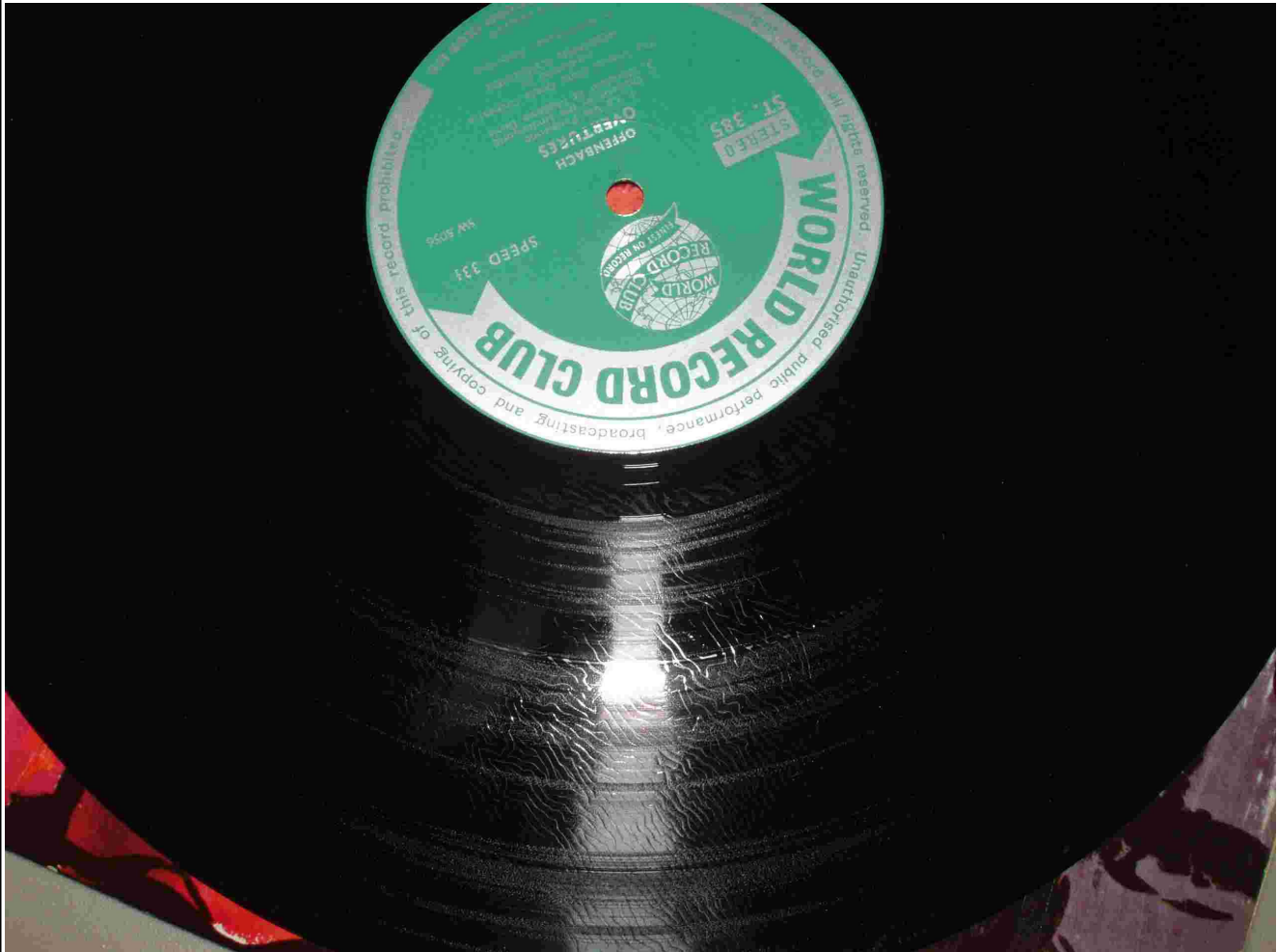
Damaged LP cause by pressure and plastic sleeves