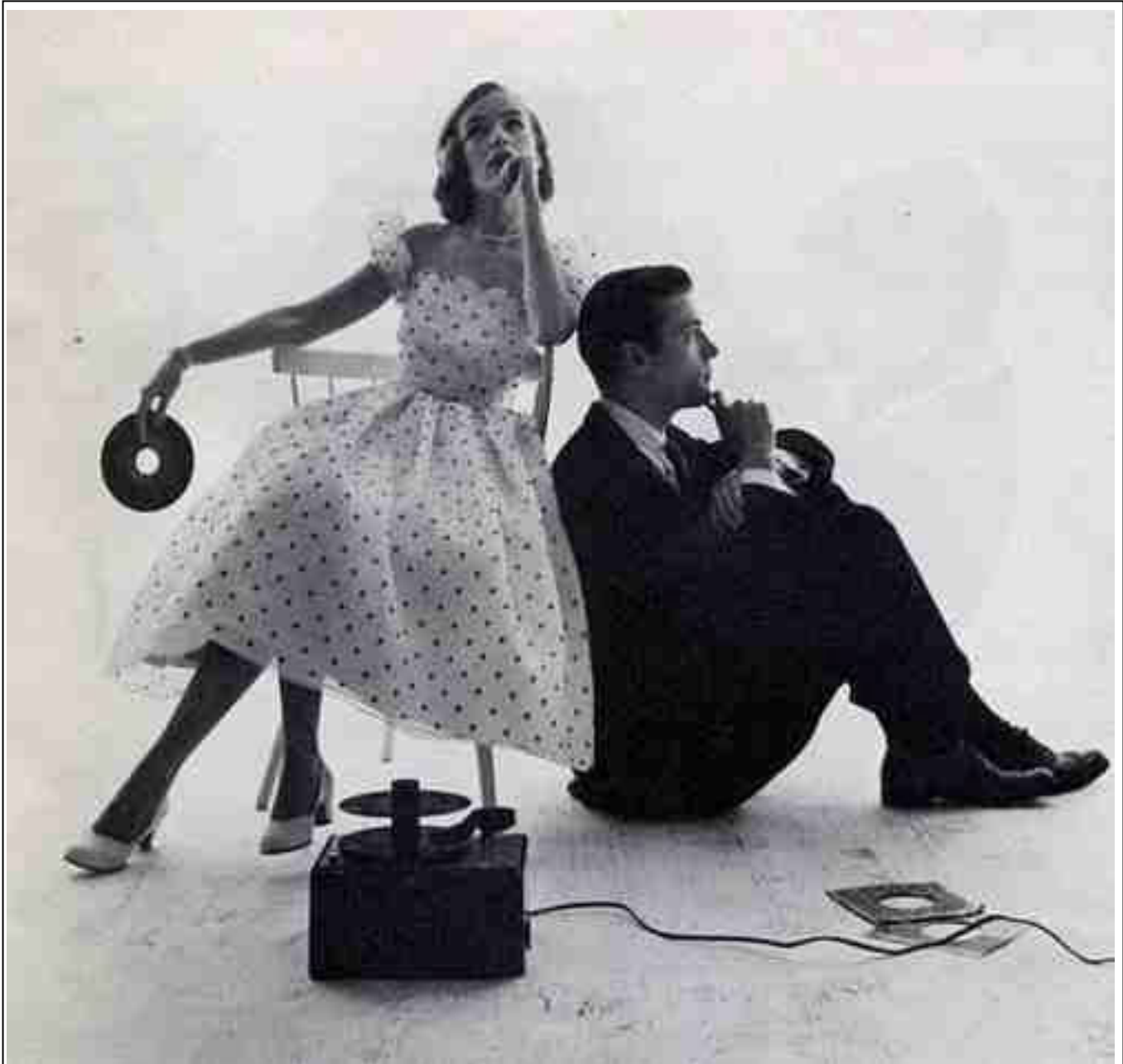
RCA Victor ad from mid 1950s.

Who needs furniture! Why not dress in your Sunday best and spend the afternoon listening to records in an empty room!