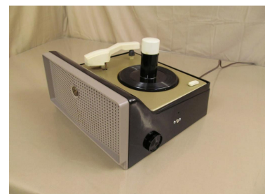
What is this?

picture above. Those very near the bottom, like this record, had permanent damage. After a thorough cleaning with a record vacuum the lines were still there. I played the record and the noise generated by the embedded lines was horrific. It was almost as loud as the music. As I went through the rest of the pile of records getting further from the bottom the records with plastic sleeves still showed the lines but I was able to remove them with the record vacuum. So it is definitely a combination of pressure and plastic sleeves causing the damage. So when they say to store the records vertically they aren't kidding! No records with paper or onion skin inner sleeves had any defects.