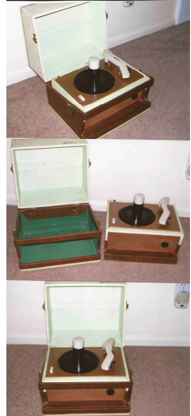
Symphonic Model 1245

If you would like to renew your subscription with an 'online' copy there is no charge . Just send me your email address.