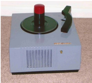
RCA Victor model 45EY after facelift

SURPRISE! There was the missing piece—taped to the inside of the bottom cover! That's when the light bulb went on and I decided to save these players rather than part them out. While it's true that they're not original; they're now enjoying a second chance at playing records. Not only that—they look great.