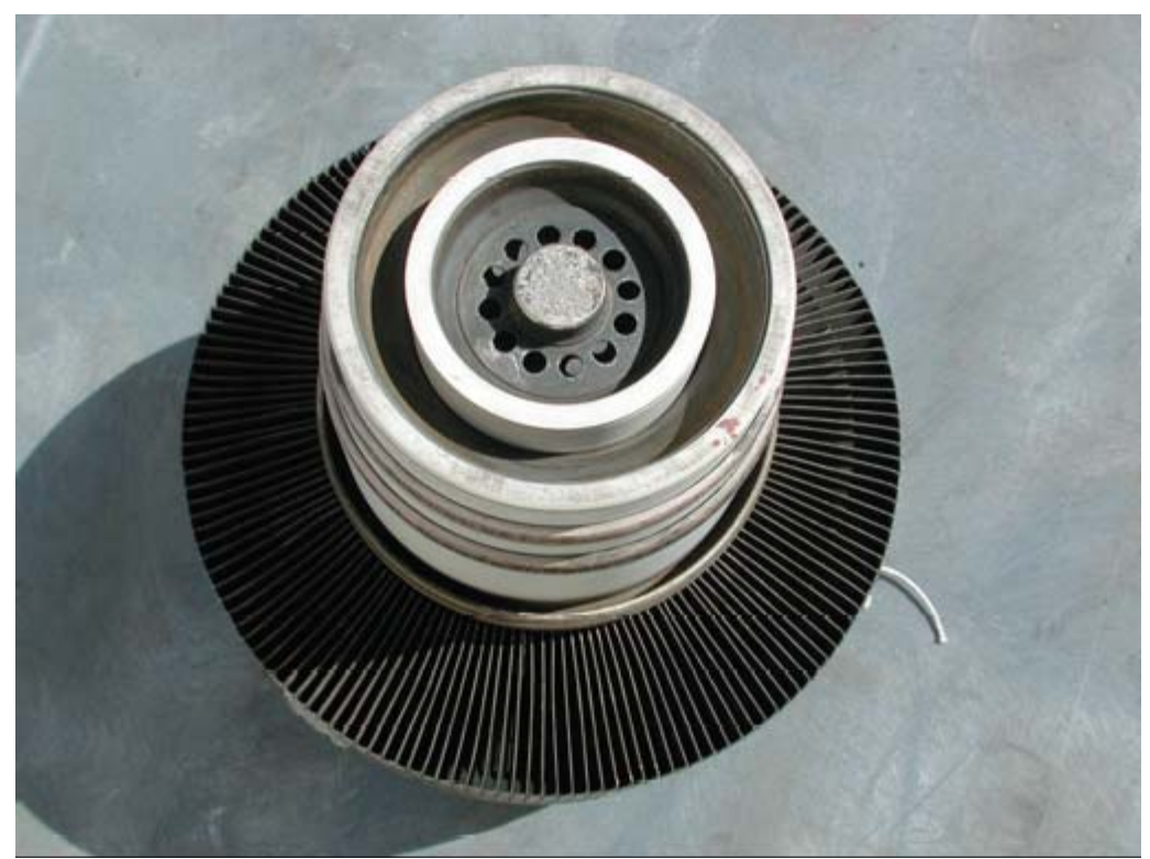
Figure 6 This tube appears to have been operated with low output efficiency (improper tuning or loading) or complete loss of air flow. Note the discolored stem and anode fins. This tube had a very short lifetime.

Eimac Application Bulletin No. 20, "Temperature Measurements of Eimac Power Tubes" describes methods for accurately determining operating temperatures on the base and anode cooler assemblies on power grid tubes. By using the techniques described in this paper, one can determine whether the cooling system in their equipment may be deficient or needs improvement. Occasionally something simple like air filters that have become plugged or a bearing failure in a blower may lead to overheated tubes. An exhaust air temperature measurement device will help spot abnormal temperature rise and prevent damage from overheating.