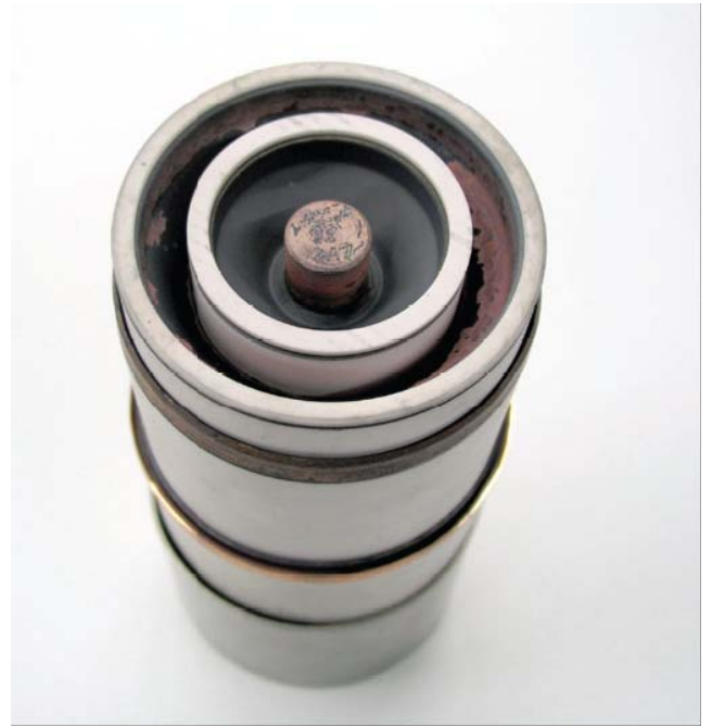
Figure 4 Water cooled tube with evidence of overheating. Note the severe discoloration in the tube stem. This tube will have a very short lifetime. Base cooling is of equal importance as anode cooling.