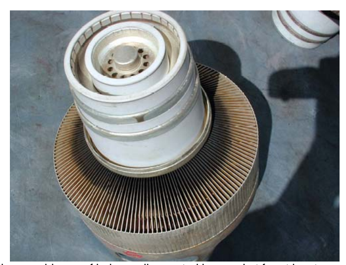
Figure 5 This tube shows evidence of being well mounted in a socket for at least a year (note the marks on the contact ring from the finger stock). However, there is no discoloration of the stem and the anode fins have some discoloration (air flow could have been improved somewhat on this tube).