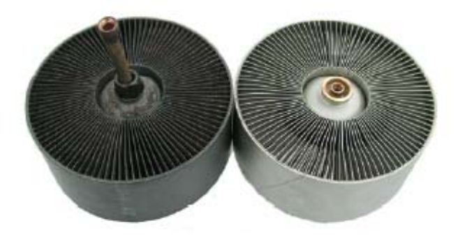
Figure 2. Improper cooling means short life. Discoloration of metal around the anode fins (left) indicates poor cooling or improper operation of the tube. A properly cooled and operated tube (right) shows no discoloration after many hours of use (note that some tarnishing of the plating may occur however).

be limited to 200°C at the lower anode seal under worst-case operating conditions. As tube element temperatures rise beyond 200°C, the release of contaminants locked in the materials used in manufacturing increase rapidly. These contaminants cause rapid depletion of the ditungsten carbide layer