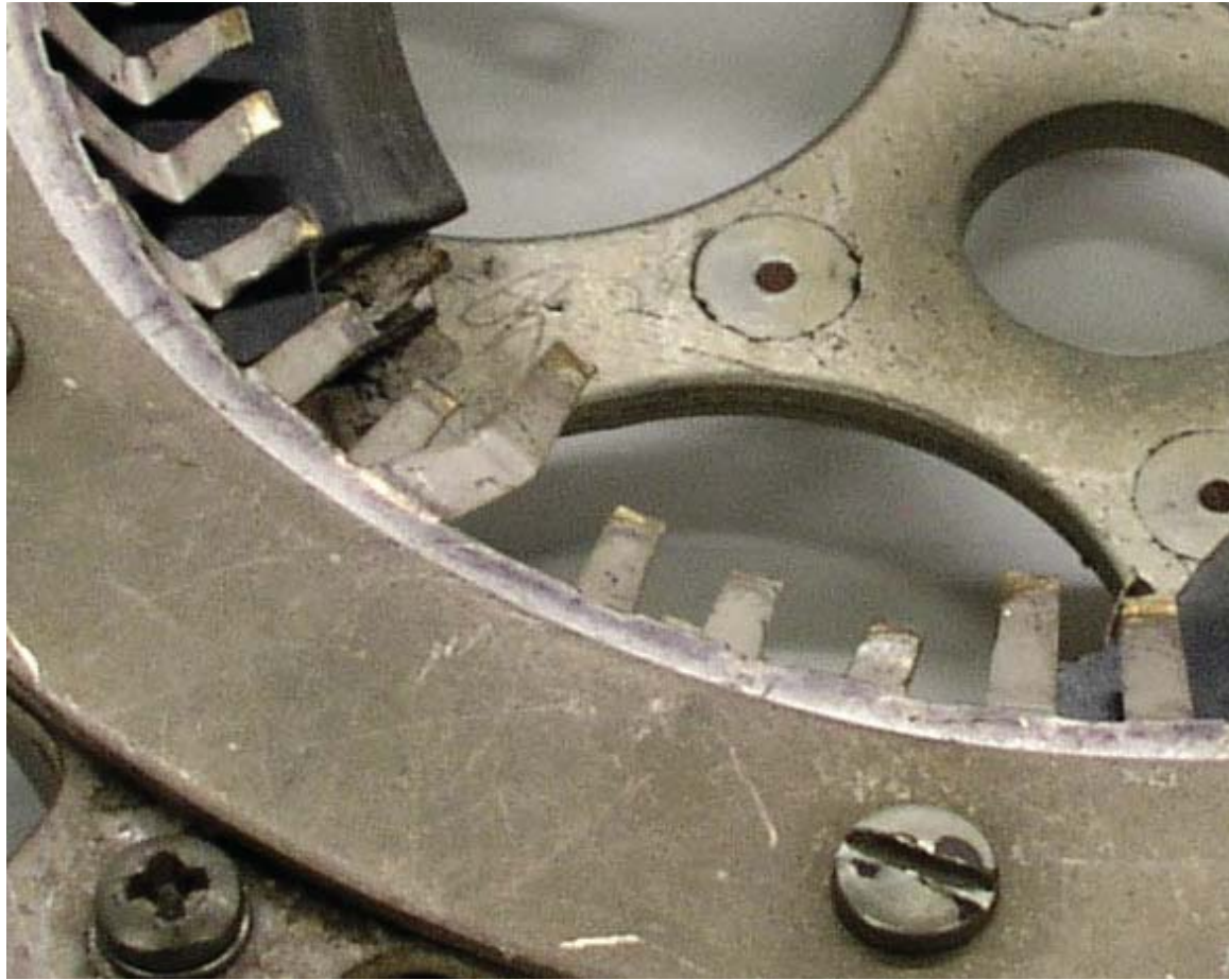
Figure 7. Bent and broken finger stock. Finger stock may become damaged due to effects of overheating or mishandling. Any broken finger stock must be repaired or replaced immediately to ensure long tube life.

Socket maintenance is an important part of regular transmitter system scheduling. Replacement parts are available for most Eimac sockets but having a spare socket on hand is the best advice for reducing down-time in case a failure occurs.