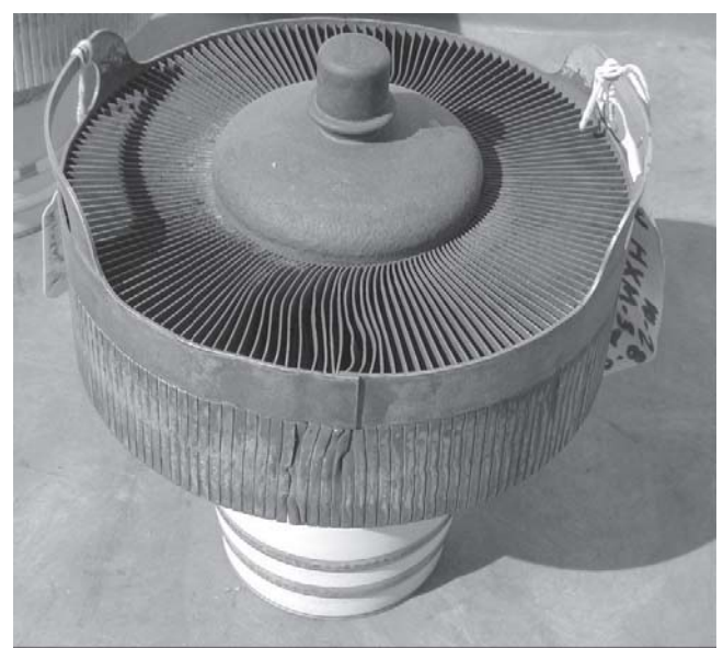
Figure 3 Example of a severely overheated tube. The cooling fins are discolored and badly distorted. This type of overheating will cause premature tube failure.